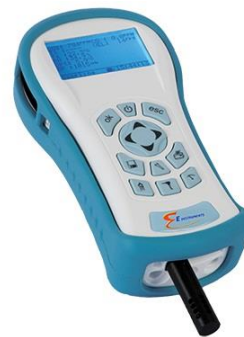
Model : SI-AQ PRO