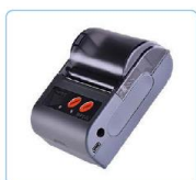
Bluetooth® Printer (Si-AQ Bluetooth® Printer)